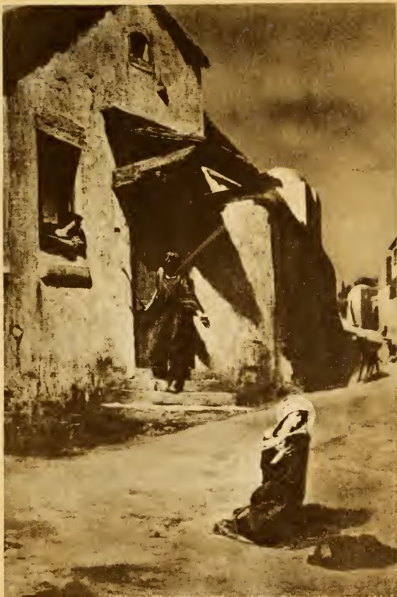
"There was no room for them in the inn."